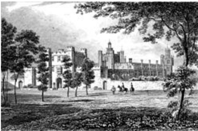
Theobald's Castle and Gardens purchased by Cecil and designed by John Gerard for the Queen. Gerard's Herball was published just before Hamlet was written.

The Great Garden...was enormous – over seven acres in extent, twice the size of Henry VIII's Hampton Court garden...it was surrounded by a wall within which it was divided into nine knot squares...Paul Hentzner describes in 1598: "...from this place ones goes into the garden, encompassed with a ditch full of water, large enough for one to have the pleasure of going in a boat and rowing between the shrubs" (Qtd. in Strong 53).